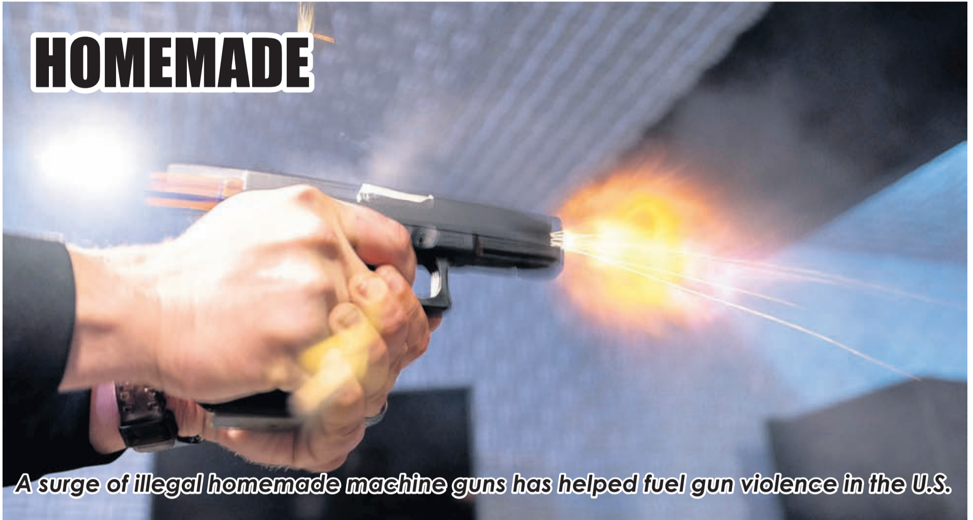
A surge of illegal homemade machine guns has helped fuel gun violence in the U.S.

A semi-automatic pistol with a conversion device installed making it fully automatic is fired as four empty shell casings fly out of the weapon, at the Bureau of Alcohol, Tobacco, Firearms, and Explosives (ATF), National Services Center, Thursday, March 2, 2023, in Martinsburg, W.Va.